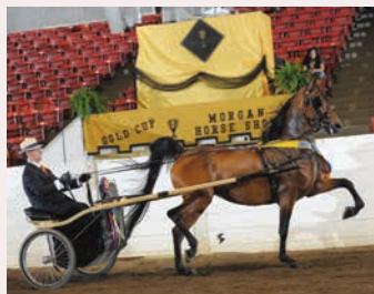
CHMH Spice Town Girl GCH, BHOF