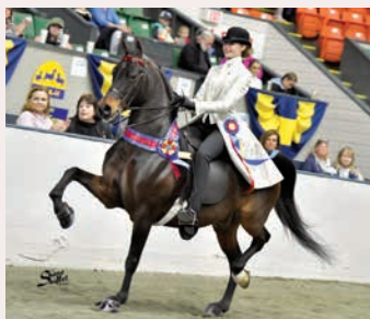
SSL Ringo GCH