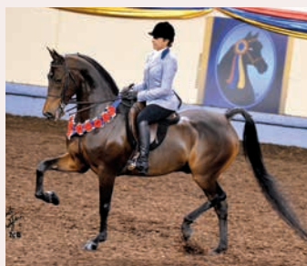
EKL Assets Vision GCH