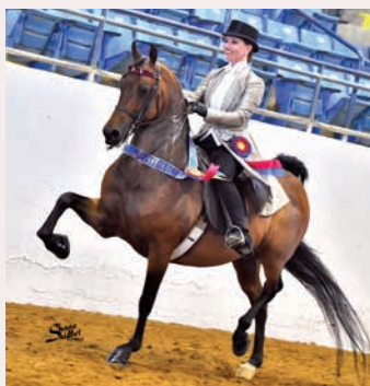
FCM Prince Of Rock N Roll GCH