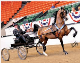
JW Standing Tall

(Tug Hill Celebrity x MI First Love, BHOF) b. 1993. Sire of 89 registered get.