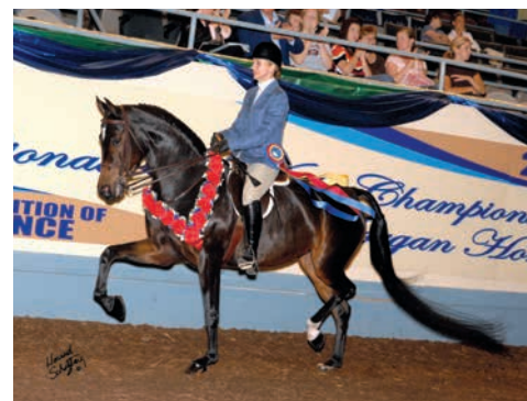
Devan Melmore, BHOF, is the dam of world champions Man In Motion (by Man About Town LPS) (1); Simple Dreams (by Tug Hill Celebrity) (1); Let's Boogie (by Born To Boogie) (3).