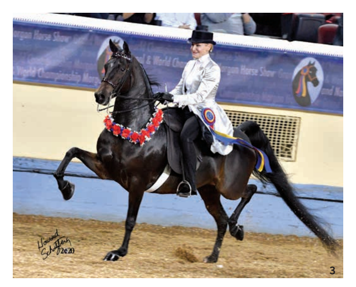
MARES & DESCENDANTS TTMF French Enchantress (1), dam of Queen's Castle Hill GCH (2) and Blurred Lines GCH (3).