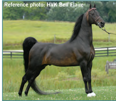
Reference photo: HVK Bell Flaire