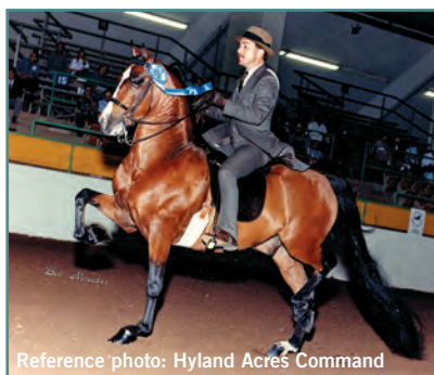
Reference photo: Hyland Acres Command