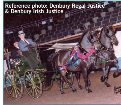
Reference photo: Denbury Regal Justice & Denbury Irish Justice

is enthused about the daughter they have retained, the 2015 filly Dragonsmeade Xs And Os. “She got a lot of her mother’s beauty, and we look forward to breeding her in the future.”