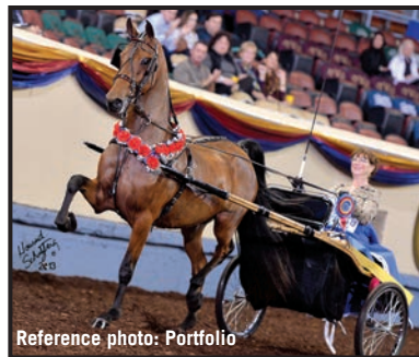
Reference photo: Portfolio