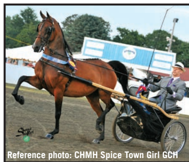
Reference photo: CHMH Spice Town Girl GCH