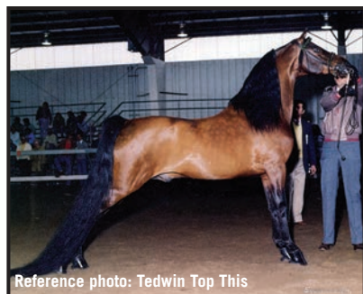
Reference photo: Tedwin Top This